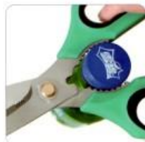
Jar opener &amp; Walnut clamp