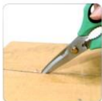
Safety Box Opener