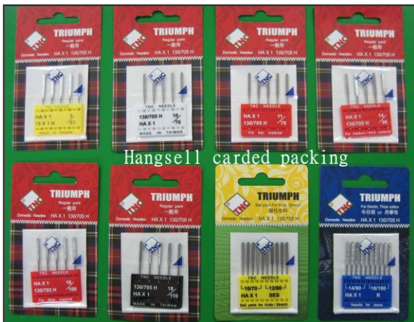
Hangsell carded packing