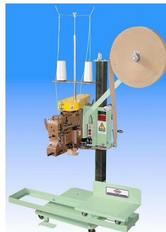
mod.EM-220B2 Pedestal with "NLI" DS-2II Sewhead