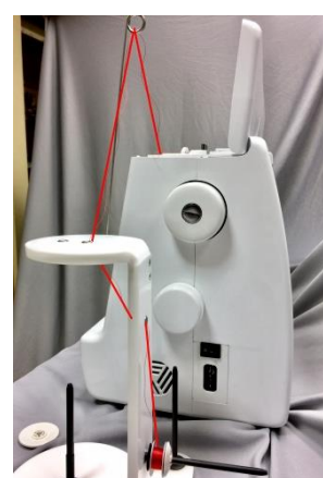
For bobbin thread.