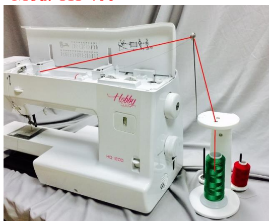
For large thread cone