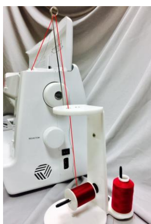
Allowing metallic thread & delicate specialty threads to feed flat.