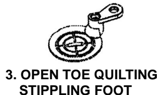
3. OPEN TOE QUILTING STIPPLING FOOT