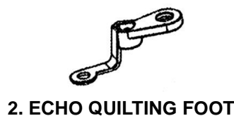
2. ECHO QUILTING FOOT