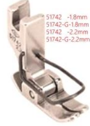
#51742-G (91-051742-03) (51742)

51742 -1.8mm 51742-G-1.8mm 51742 -2.2mm 51742-G-2.2mm