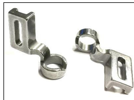
#RF-IND Ind. high shank

* These feet are made of solid steel precision machined by CNC machine center