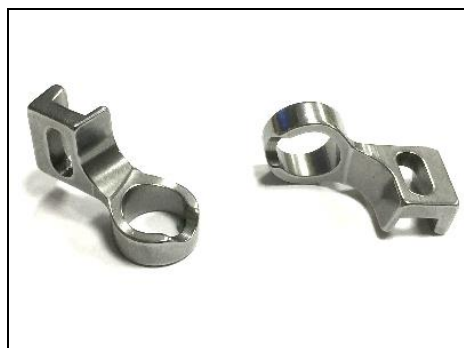
#RF-LS low shank