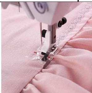
#4130583-45 Clear B edge joining foot