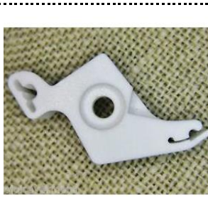
#4124112 Viking shank