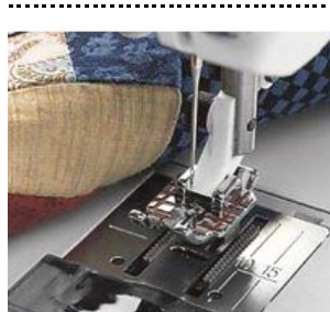
#4127855-45 1/4" quilting foot