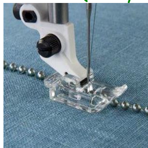
#4130304-45 2-3mm clear embellishment foot