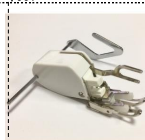
#10449V Walking foot w/quilting guide