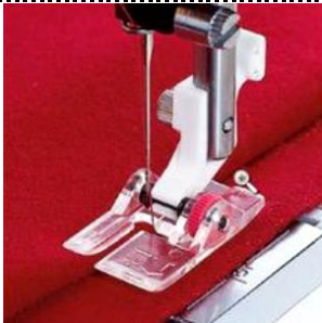
#4129766-45 Adjustable blindstitch foot