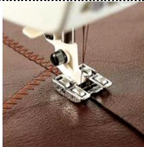
#4129902-45 Roller foot