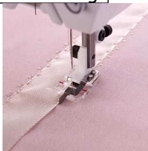
#4130584-45 Clear B stitch in the ditch foot