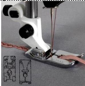
#4129898-45 Braiding foot