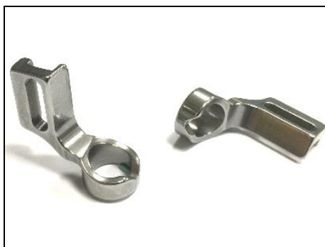
#RF-MS medium shank