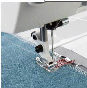
#4130348-45 Clear seam guide foot