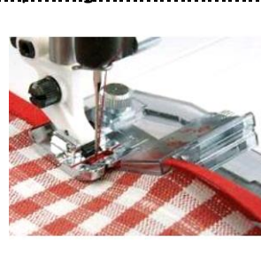
#4129850-45 Adjustable blind foot