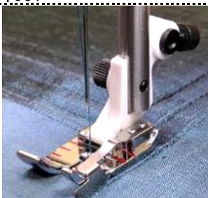
#4129141-46 1/4" edge joining foot