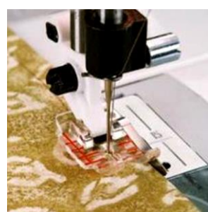
#4129274-47 Clear view 1/4" piecing oot