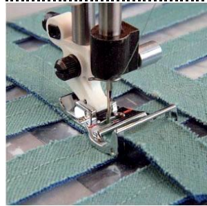
#4129752-45 Chenille foot