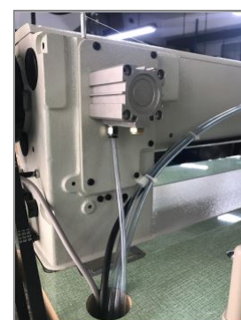
Auto foot lifter