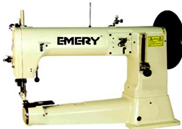
Mod. EM-471 Upper & Lower Feed