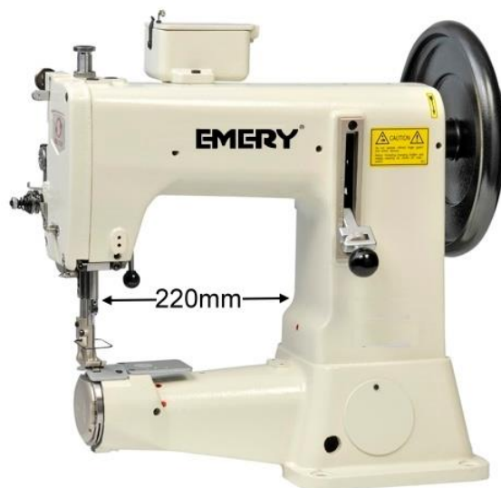
Mod. EM-400 Unison Compound Feed EM-400B -ditto- but for binding Working space: 220mm