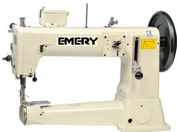
Mod. EM-441 Unison Compound Feed

Cylinder Bed Extra Heavy Duty Lockstitch Sew. Machines.