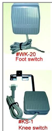
#WK-20 Foot switch

To be used with conventional clutch motor