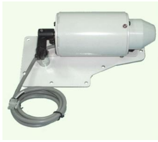
#AK-85 for DDL-8700 etc.