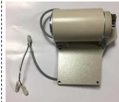
#KS-7000 Brother S-7000DD