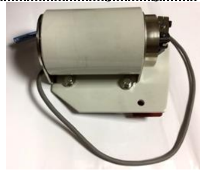
#KS-7300A Brother S-7300A

The PF-1 series is designed for all industrial sewing machines.