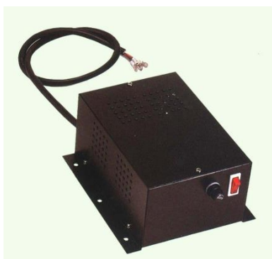
#SB-1 Power pack