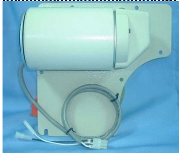
#KS-50 Brother S-7200A