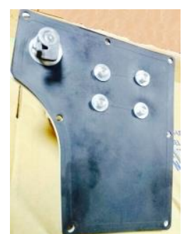
Rear cover packing