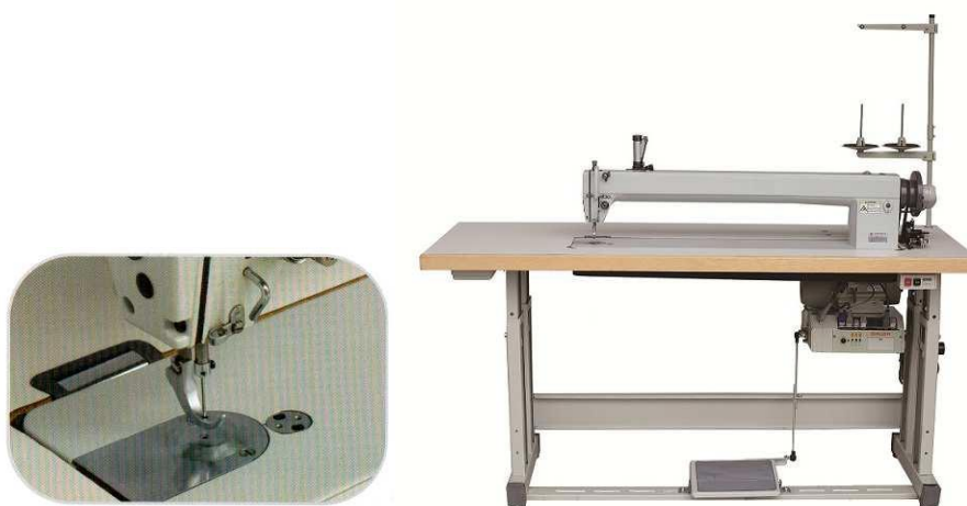
mod. QSR-2001 long arm 780mm (work space) Sewing speed : 120 ~ 1,200 s.p.m. Max. foot height : 20mm Max. thickness : 70mm servo motor : 600W