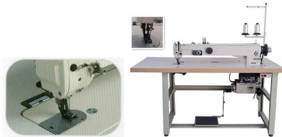
mod. LS-2002 long arm 780mm (work space) Max. foot height : 12mm Max. speed : 2500 s.p.m. Max. thickness : 60mm servo motor : 600W

Heavy duty upper & lower feed zigzag sewing machines for sewn-on labels on panel or mattress. No rear puller is required.