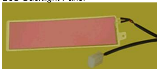
LCD Backlight Panel