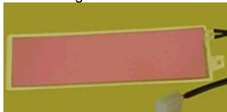
LCD Backlight Panel